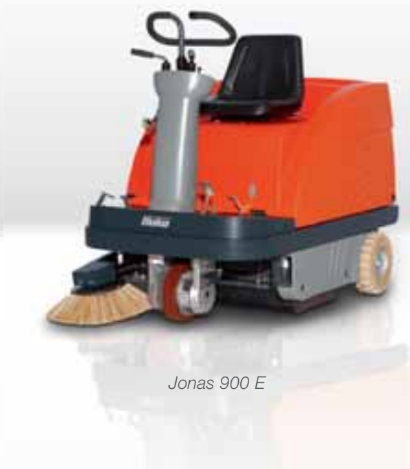
Jonas 900 E