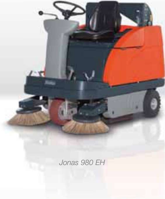
Jonas 980 EH