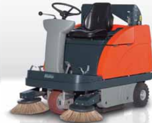
Jonas 980 EH